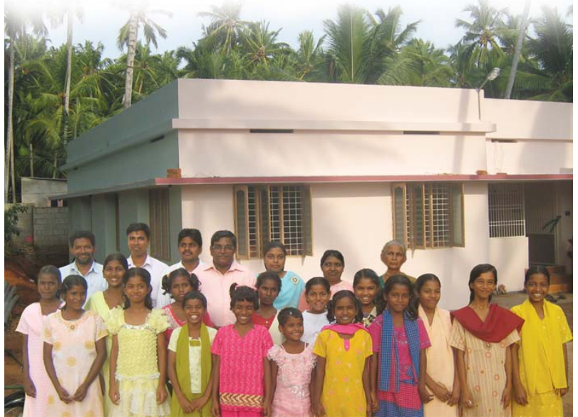
A matter to smile at and a home to live in- Children with Home parents and Local Pastors

center for women and a worship center. We seek prayer and support from Gods' children, worldwide, who see this as a meaningful service to help those who really need help. Jesus loved the children and the poor. Can we also open our hearts to them?